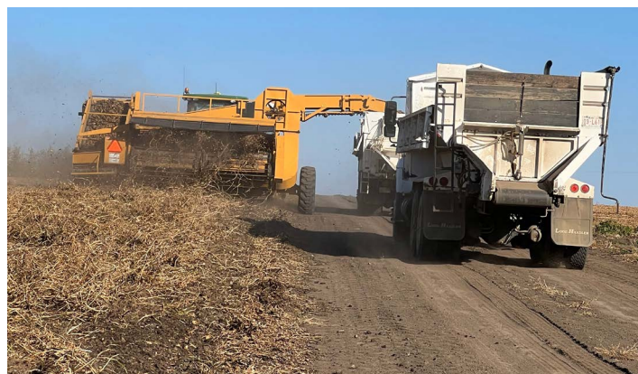
Top photos: Matt Visser of Norbest Farms Ltd. filling last harvest load of potatoes. Bottom Left & Middle: Great North Seed Potatoes Ltd. harvest and sorting. Bottom right: Hoogland Farms harvest crew also sorting and removing unwanted potatoes, rocks and debris before spuds enter storage facility.