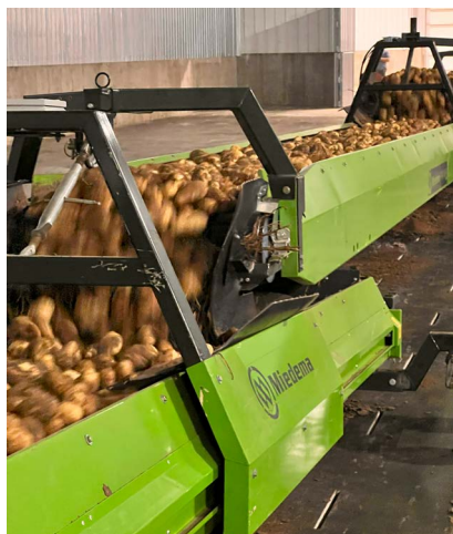
Top Photos: Boston Farms Ltd. potato harvest in Coaldale. Bottom: Rocky Trail Farms Ltd. harvest in Purple Springs. All looking forward to the end.