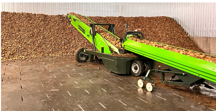
Boston Farms Ltd. filling storage with this years potatoes

growing areas were blessed with timely rains throughout the growing season, and as such, the growers are having to work diligently finding space for their crop as well. As many experienced growers would say, now starts the second season of growing potatoes, keeping them healthy and alive in their storages until they are needed by the customer.