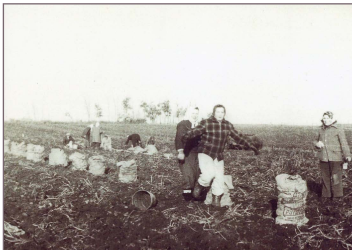
Groot Farms harvest in the 1960's; in the days of bagging potatoes by hand from the field.