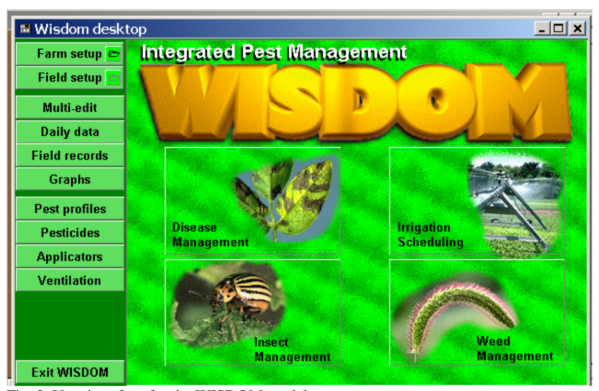
Fig. 2. User interface for the WISDOM model.

WISDOM. The WISDOM model was developed by the University of Wisconsin Extension in Madison, Wisconsin, as a four module Integrated Pest Management and Irrigation Scheduling decision support tool (Stevenson, 1993). Advice on timing and application rate (low, medium, and high) of fungicides for both early blight ( Alternaria solani ) and late blight ( Phytophthora infestans ) disease development on potatoes is contained in the disease management module. Insect management, weed management, and irrigation scheduling are the other modules contained within the WISDOM model (Fig. 2).