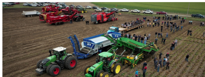
Top: 2019 South Harvest Demo Bottom: Ag Expo Booth