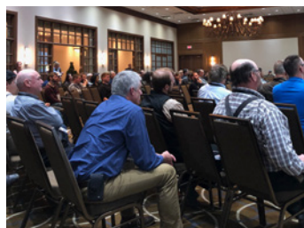
2019 Potato Conference