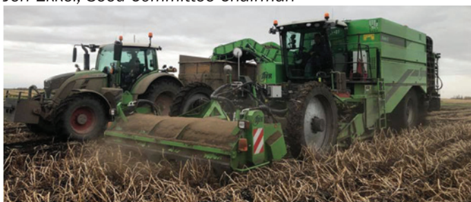
Top: Hoogland Farms 2019 potato harvest. Bottom Left: Great North Seed Potato farm high-generation seed field June 29, 2020. Right: Groeneweg Farms planting mini tubers 2020.